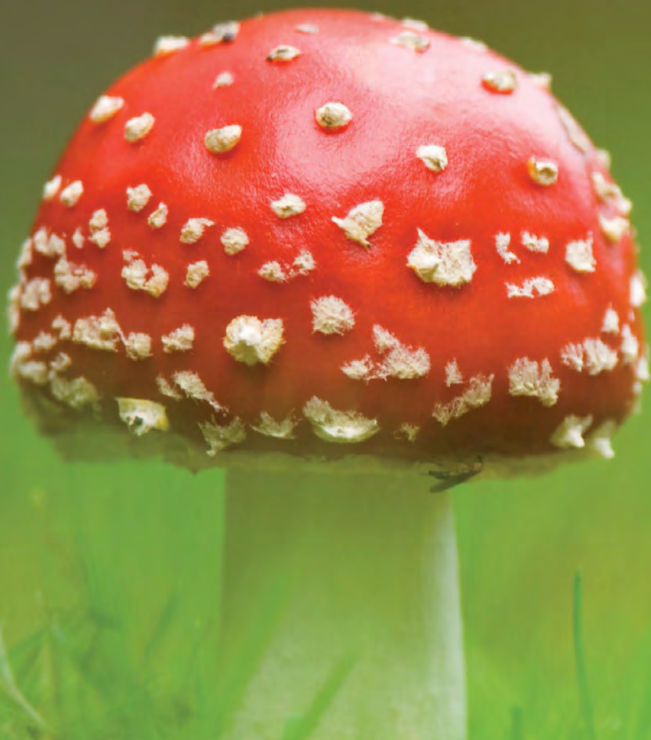
Fly Agaric